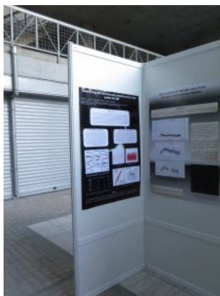
Άποψη του χώρου ανάρτησης.